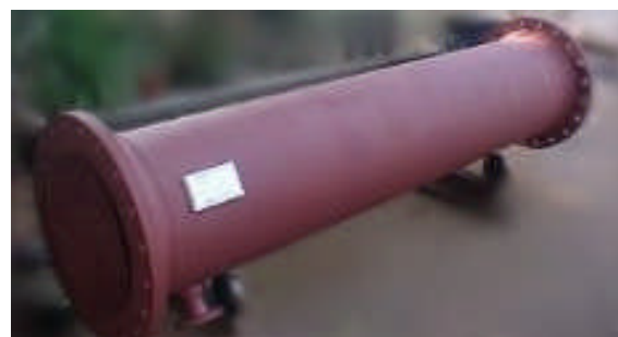
Housing with injection point